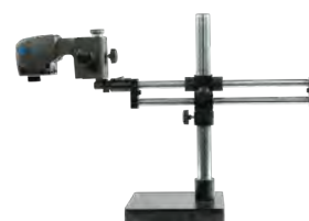
Double arm stand