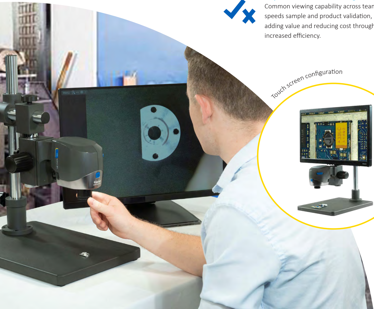
Touch screen configuration

Common viewing capability across teams speeds sample and product validation, adding value and reducing cost through increased efficiency.