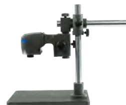
Single arm stand